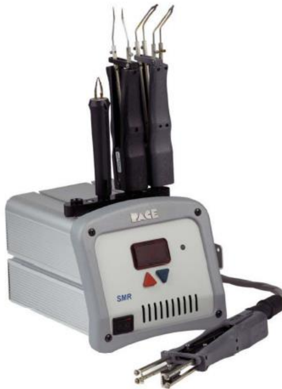
SMR Power supply (Shown with three optional handpieces and the connected TS-15 StripTweez)